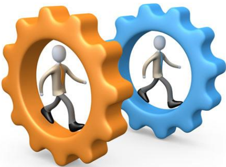
This Photo by Unknown Author is licensed under CCBY.

Join us for a fun-filled day, jam packed with interesting visits. Your life will never be the same again.